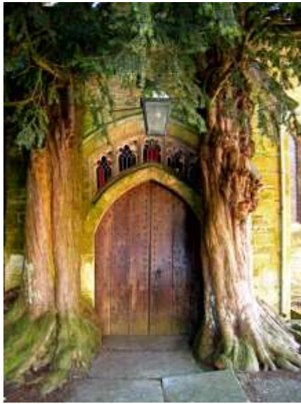
The ancient, cavernous, underground complex of Moria is one of the coolest places of Middle Earth in J.R.R. Tolkien's Lord of the Rings.

But did you know that part of it may have been inspired by a real place? St. Edward's Church serves the small town Stow-on-the-Wold in Gloucestershire, England.