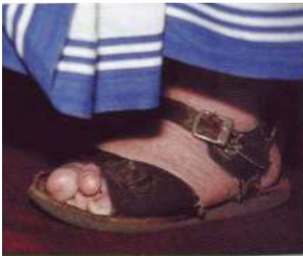
This is a close up photograph of Mother Teresa's foot.

As you can see, she has deformed toes, they are gnarled and pressed in the wrong directions. Why you may ask? Was it a birth defect, the result of an accident, the side effects of a disease or illness? No, it was none of those. The mission organization that Mother Teresa worked for used to receive a shipment of used shoes to be distributed amongst those that needed them. This amazing woman used to dig through that pile of shoes and find the very worst pair. She would take them for herself regardless of how badly they may